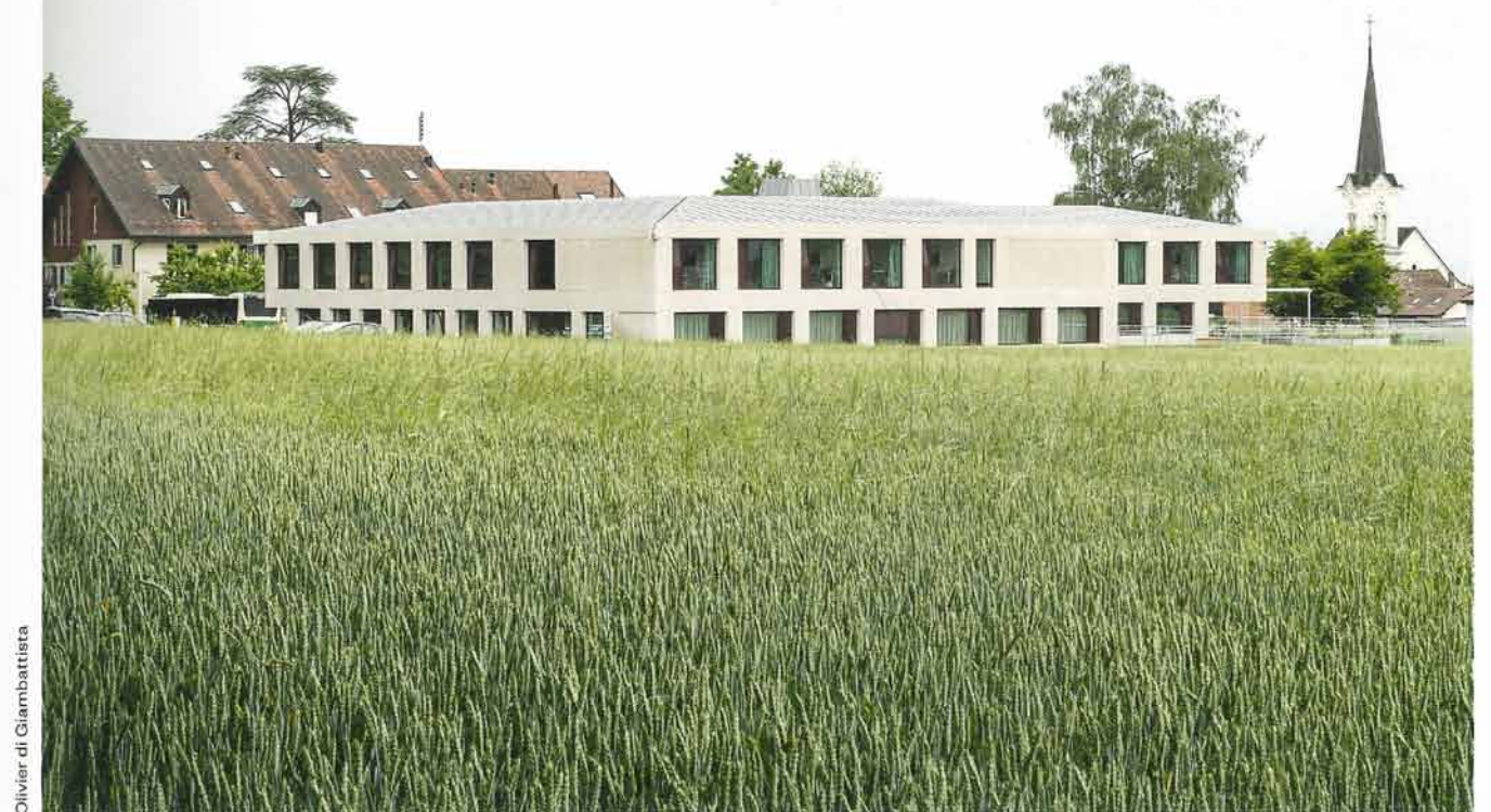
Olivier di Giambattista

The building offers views of the surrounding countryside and the village church